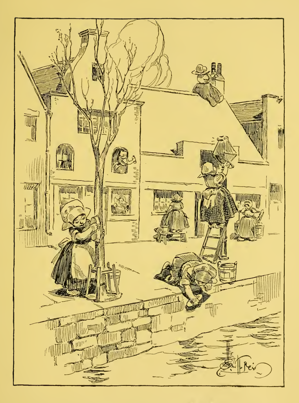
THE SCRUBBING-BRUSH THE NATIONAL EMBLEM OF HOLLAND